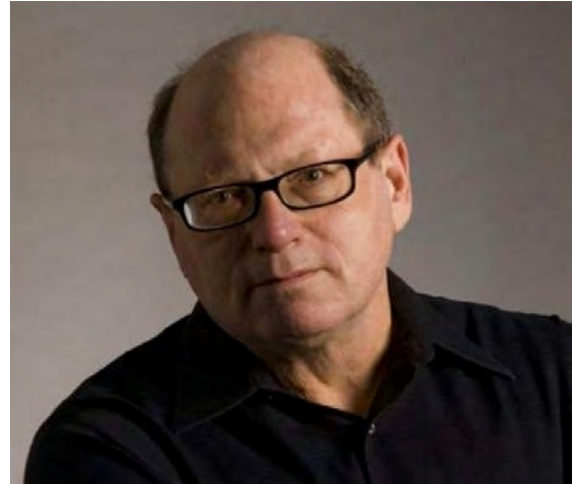
Famous Hispanic Americans