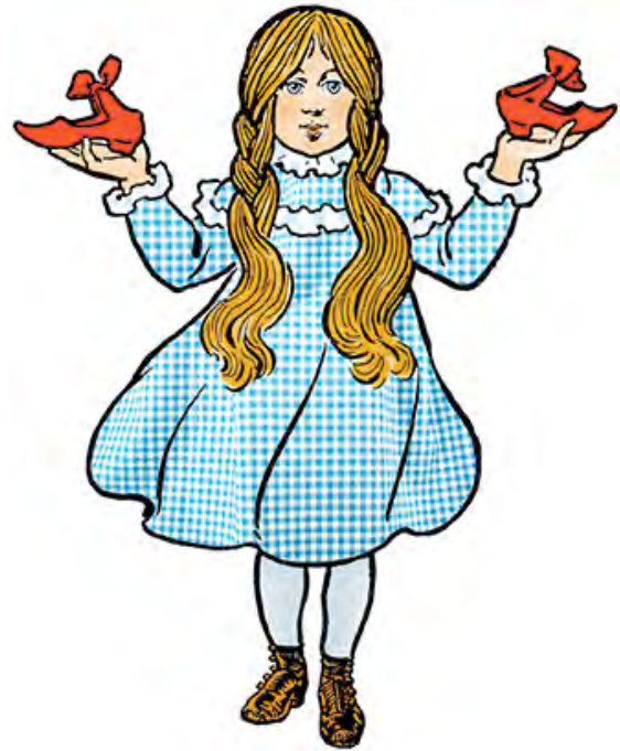
There's No Place Like Home!

Non-Profit Organization US Postage PAID Lawrence, KS Permit #12